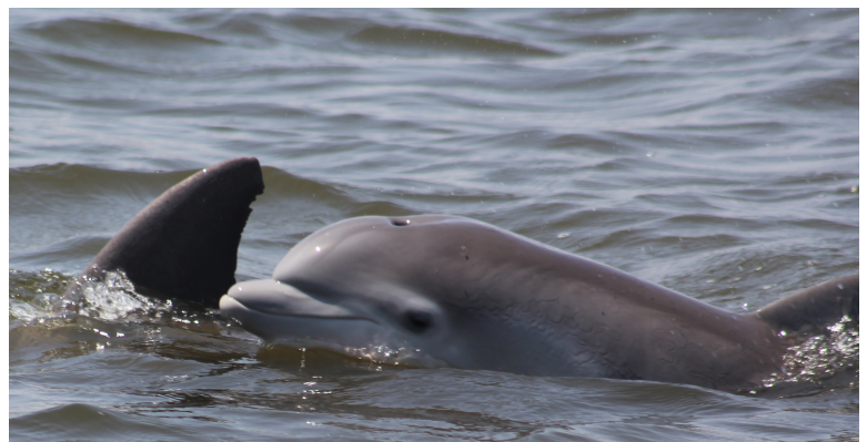
Emma's new calf!

This season, two new dolphins were named, Emma and Virginia. Emma is a female dolphin matched to the Beaufort catalog and was accompanied this year by a new calf! Virginia received her namesake by being the only dolphin so far matched to the Virginia catalog. Dolphins lost this year include Buddha, a male dolphin paired with Mohammed who we had been studying for many years.